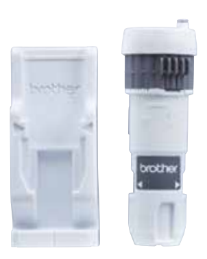
CAUNIPHL2 Small Barrel Pen Holder