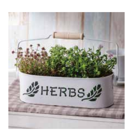
CASTCL1 Stencil Sheet Includes: 1 sheet 12" x 24" (305 x 610mm)