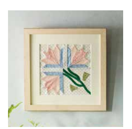
CASTBL2 High Tack Adhesive Fabric Support Sheet Includes: 4 sheets of 12" x 12" (305 x 305mm)