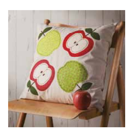
CASTBL1 Iron-on Fabric Appliqué Contact Sheet Includes: 1 sheet 36" x 18.5" (914 x 470mm)